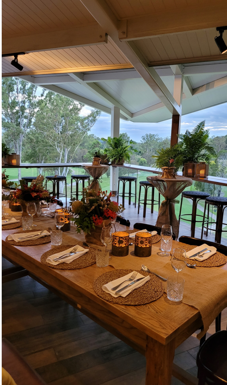
styling by arrangement co